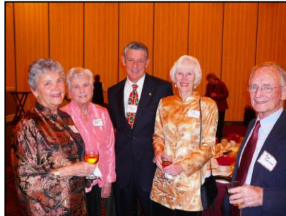
Just in case you were wondering, Satin is "in" this Christmas