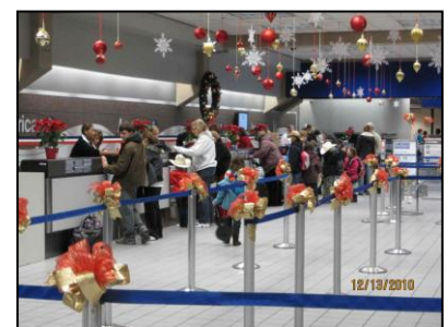
Homeward bound, after four days of rodeos, puppet shows, and hundreds of new found friends.