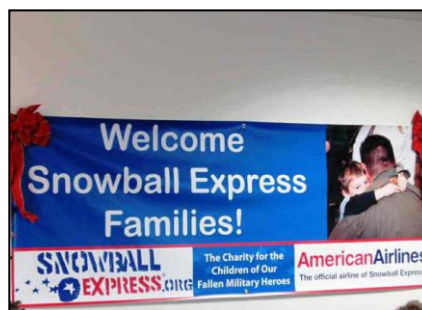
Volunteers met the families - including the entire Hillcrest HS football team - to help load buses to the Hilton