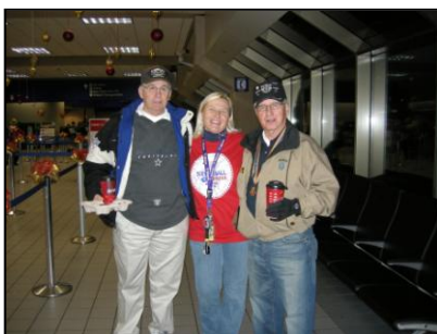
Luggage handlers – at five o'clock in the morning – greeted the incoming flights